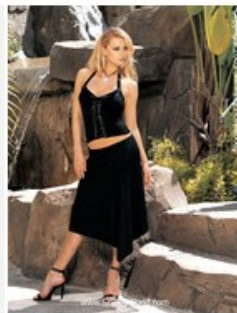
Top & skirt EURO 125,00