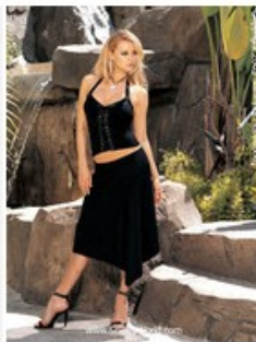
Top & skirt EURO 125,00