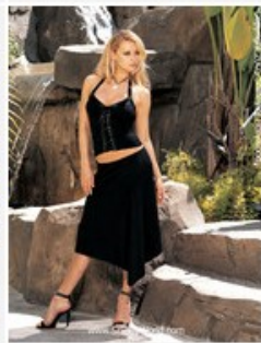
Top & skirt EURO 125,00