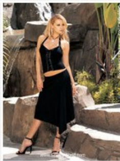
Top & skirt EURO 125,00